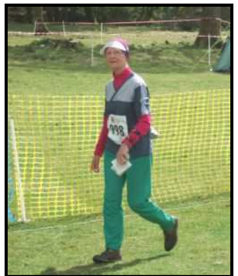
BOC Individual Day