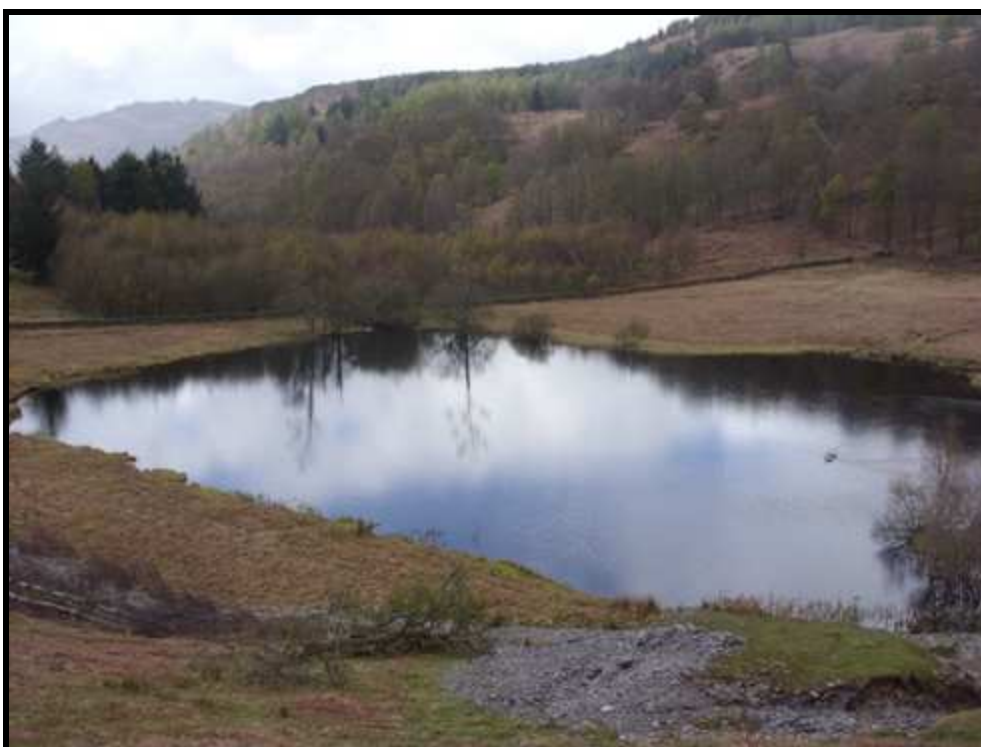
View from JK Assembly area