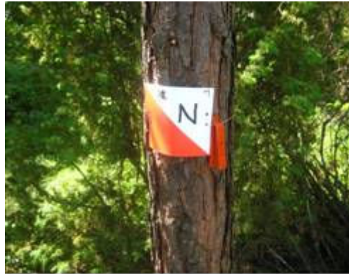
A permanent control with needle punch

The permanent controls are 20x20 cm plastic cards attached to trees and are not to be confused with the occasional conventional orienteering markers forgotten by previous event planners!