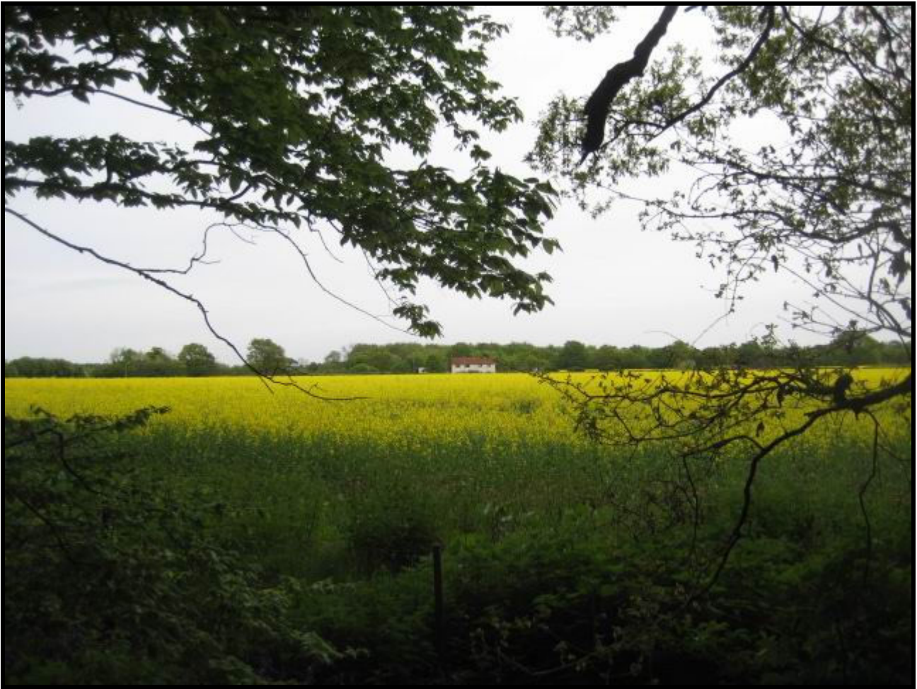
Layer wood from Pods Wood