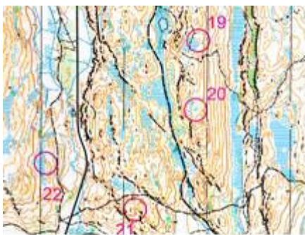
An extract of the Skatås map

Stragglers who participated in the SOS Swedish O Tours of 1986 or 1990 (a small and select group) will be distressed to learn that the fine Skatås Sports Centre ('Motioncentralen') on the Eastern fringe of the city has been razed to the ground though their distress may be eased when I explain that an even better centre has been built to replace it on an adjacent site.