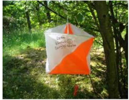
An abandoned competition control marker

The changing rooms are pristine, lockers for clothing and valuables are provided, with users expected to provide their own padlocks, though a small number of padlocks can be borrowed from Reception.