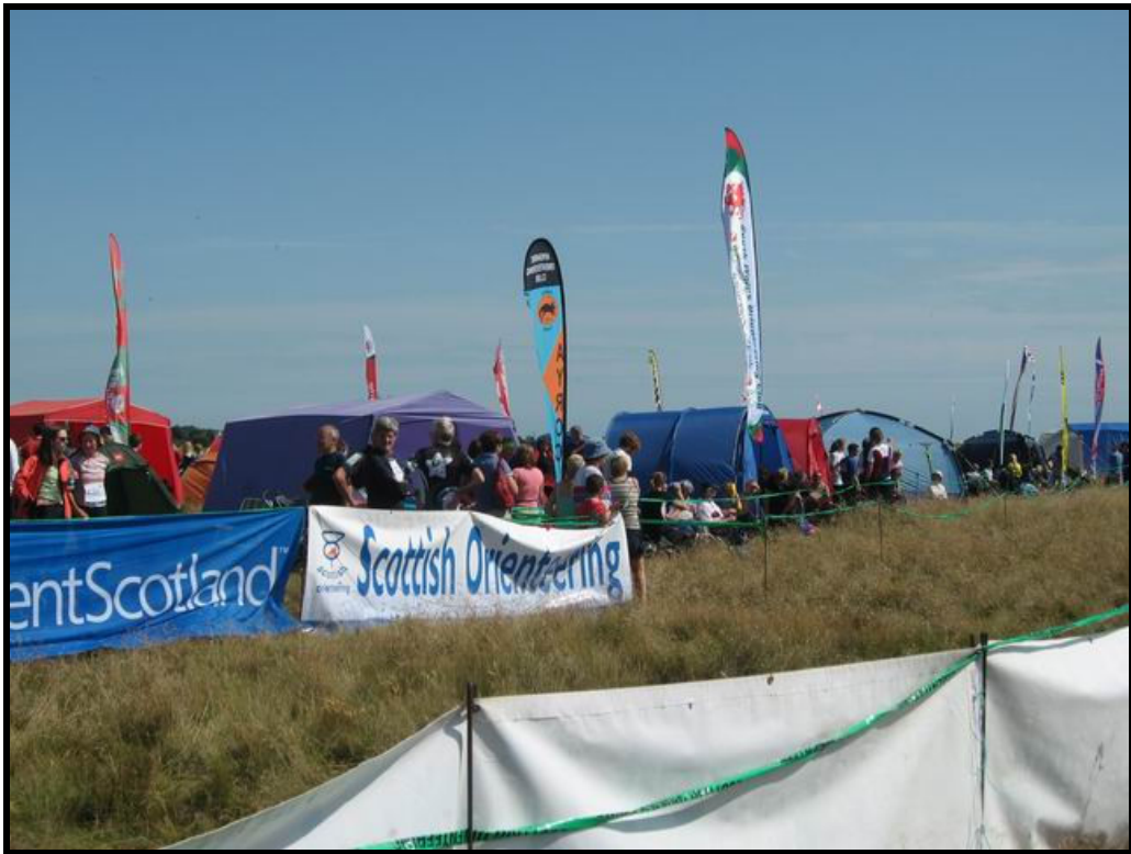
The empty run-in at the Scottish 6 Days. Just add a Straggler from below!